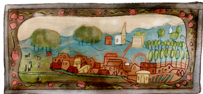
This is a copy of the oldest painting of Chesham c.1760s